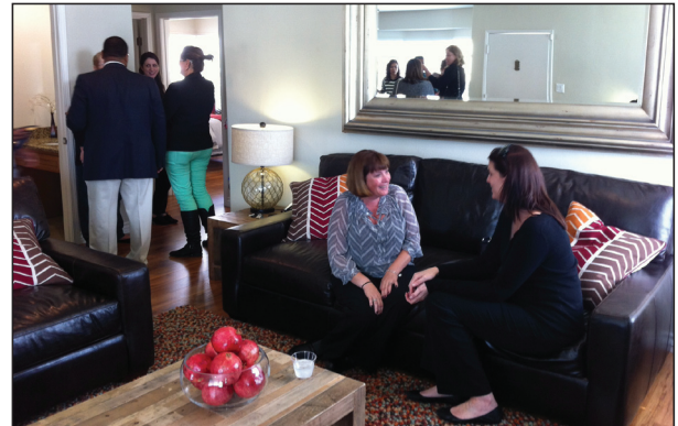
Visitors enjoy the Open House of HOPE's Property on 63rd Street in Ladera Heights. The residence will be the home of three people moving from a state developmental center.

As always, consult the IRS and your tax person for advice on how you can make charitable giving work for you!