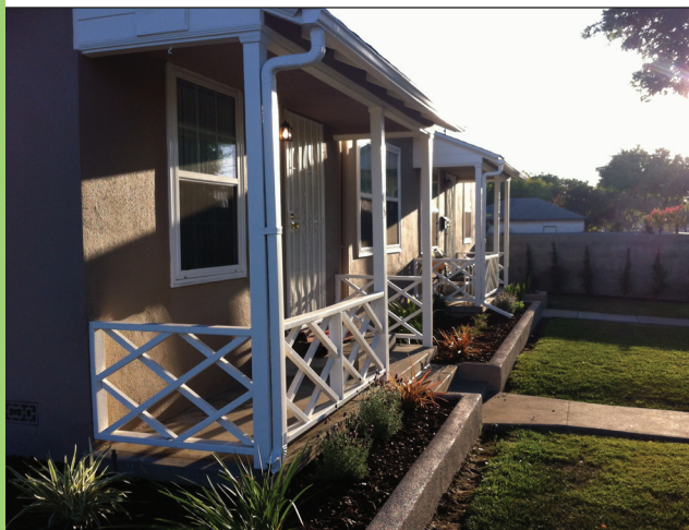
The Crenshaw duplex, home for four residents, receives a much-needed face lift and landscaping thanks to event participants.

The purchase and renovation will take place in three phases over the duration of the 5 years, as funds are raised. For every two dollars raised HOPE will add on dollar from its existing reserves. If you are interested in supporting this very important effort please contact a member of the HOPE staff or Board to find out how you can help make the dream of independent living a reality for more people with developmental disabilities.