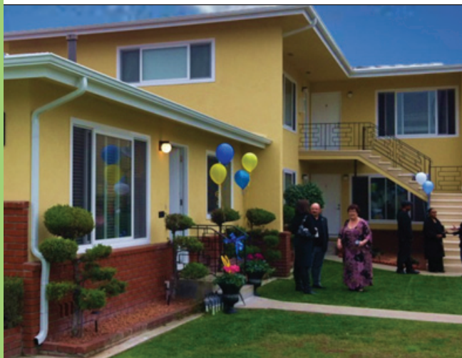
The Grand Opening of the College to Career Program's first home provided eight individuals with a college dorm. The recent addition of the house on Heather Street brings the capacity to a total of 14 student-residents.

HOPE is thrilled to announce that we will be embarking on a 5 year Capital Campaign starting in 2014 to raise over 2.6 million dollars to purchase more properties for our Affordable Rental Housing Program. HOPE will be seeking out funds from cities, foundations and donors to purchase three properties. These purchases will result in allowing 15 people with developmental disabilities to move into an affordable property and pay no more than 30% of their income for rent.