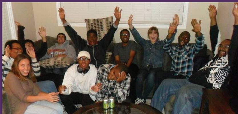
Students at the C2C house enjoy a study break.

We appreciate your generous support of HOPE over the years, and we will soon have many new options for you to continue your support. Providing safe, affordable homes for individuals with a developmental disability is our mission – and we can't do it without you.